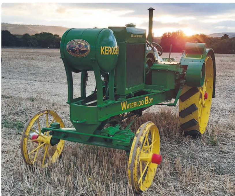
Last to go home.....