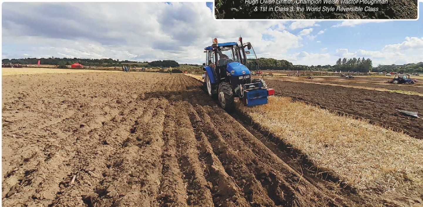
Hugh nearing completion of his plot, showing how quickly the soil was drying out