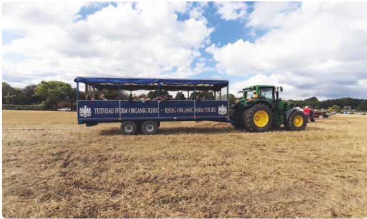
Rhug Organic loaned their passenger trailer for the day