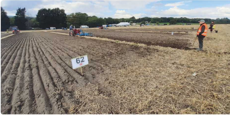
The High Cut Class