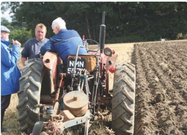
Time for a quick chat....