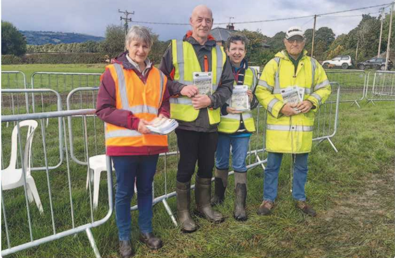
The Gate Stewards doing a sterling job