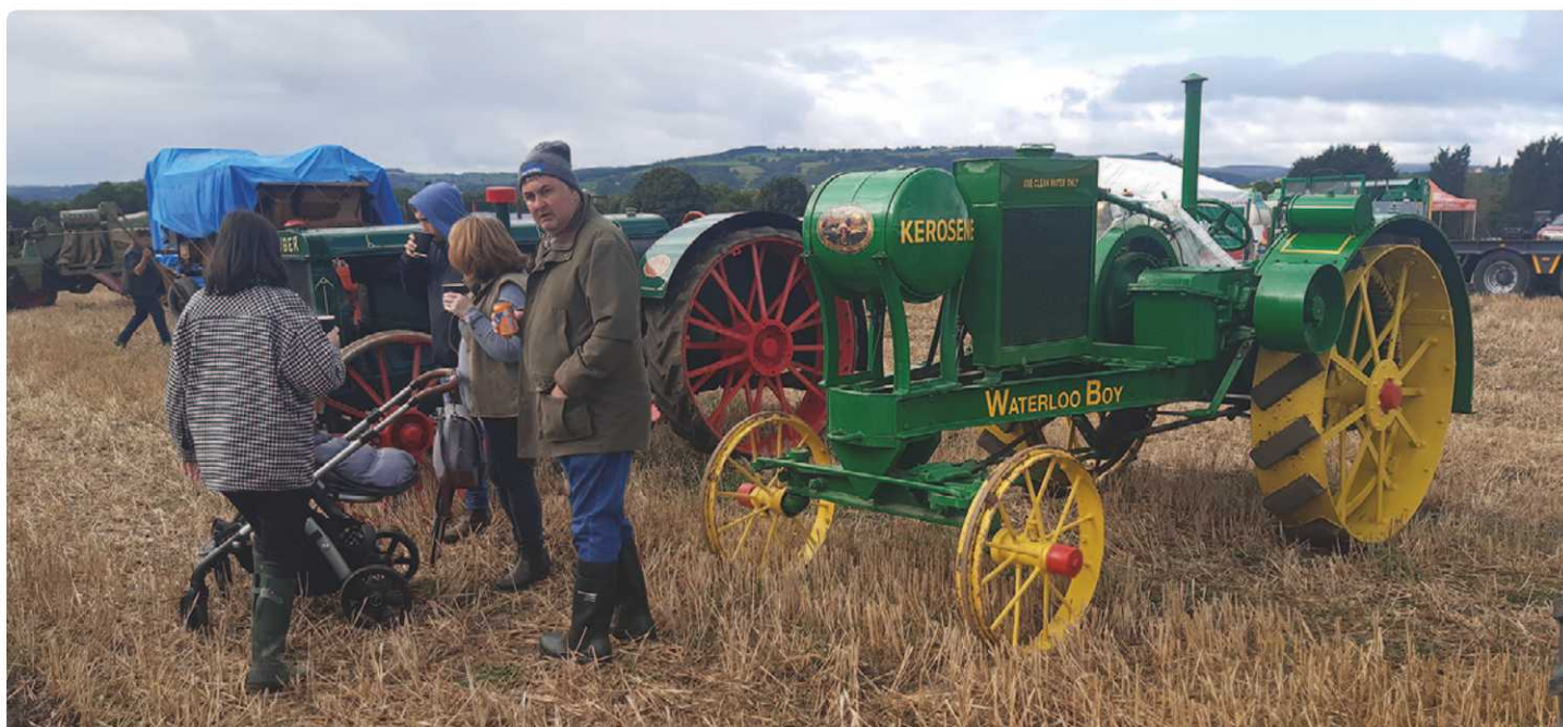
The John Deere Waterloo Boy attracted a lot of interest during the day