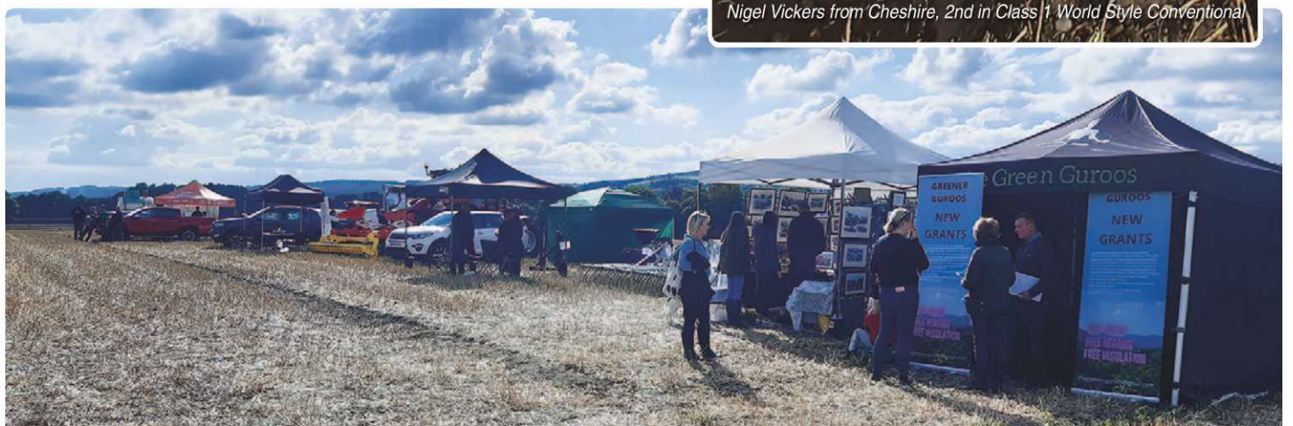
A good show of tradestands