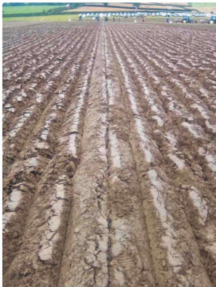
Evan's third place plot on Day 2 on grass