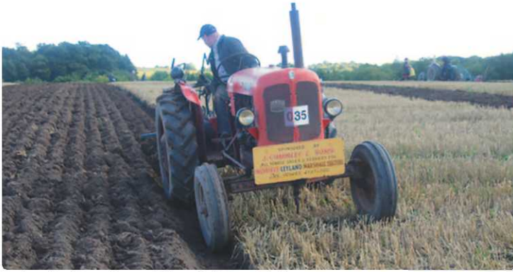
Andrew Buckley, winner of Class 5, Vintage Trailer