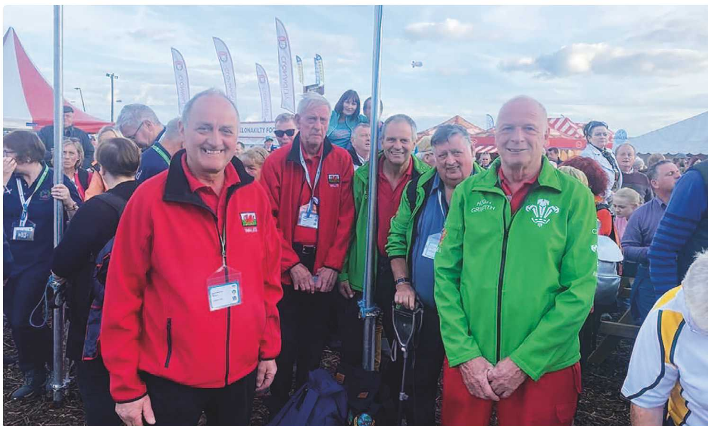
The Welsh Ploughing Team at the Raising of the Flags Ceremony