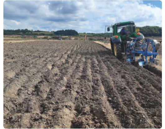
Clive Roberts from just over the border in Shropshire, 2nd in Class 3 World Style Reversible