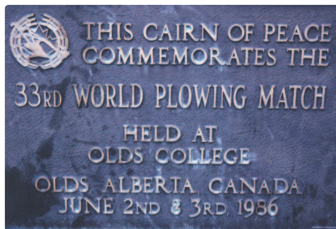
A reminder of a previous World Contest hosted by Olds College