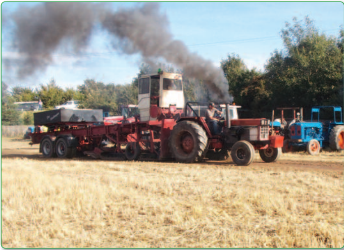
Building up a head of steam at the tractor pulling.....