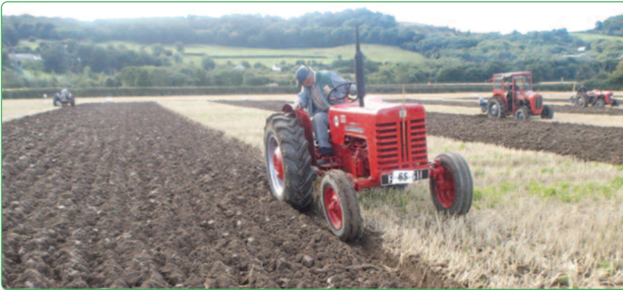
Des Cook, local competitor in Class 6