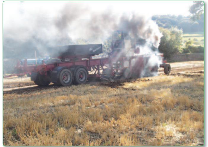
.....to disappear into a cloud of smoke moments later!