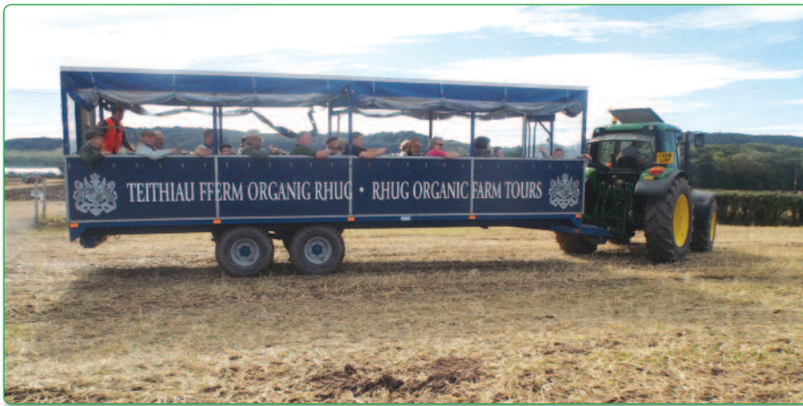
Spectators catching a lift to view the ploughing