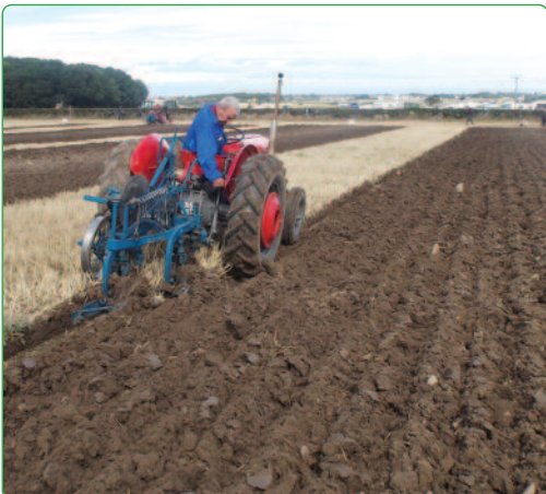
Garry Whitehouse of Monmouthshire in Class 6