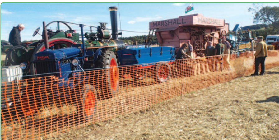
Marshall Threshing Drum