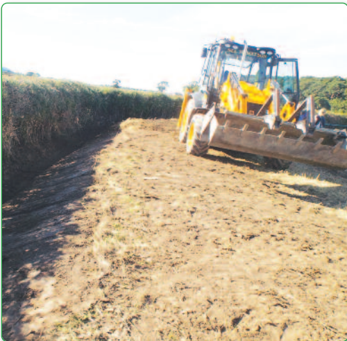
A fine example of the mechanical ditching competition