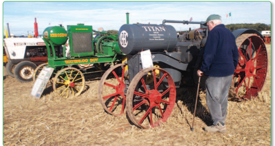
Some of the earliest exhibits in the vintage display – this is a 1917 International Titan and a John Deere Waterloo Boy