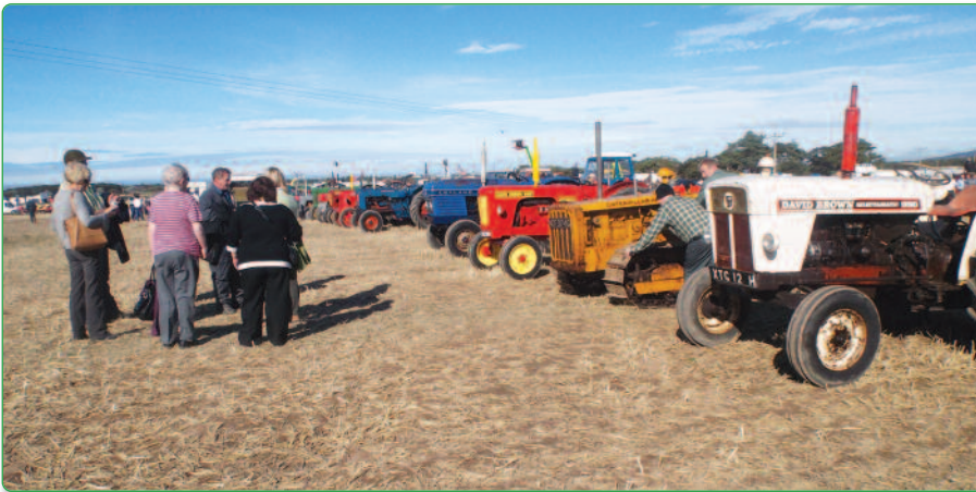
Vintage & Classic Tractor Display