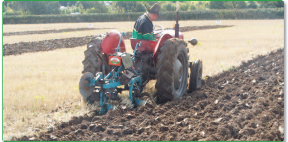
Tony Bradley of Monmouthshire ploughing in Class 6 Vintage Hydraulic Class