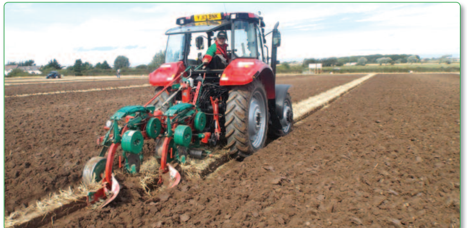
Evan Watkin of Welshpool in Class 1